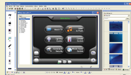
Integration Designer® Programming Software

5775 12th Avenue East, Suite 180, Shakopee, MN 55379 PH: (952) 253-3100 • Website: www.rticorp.com