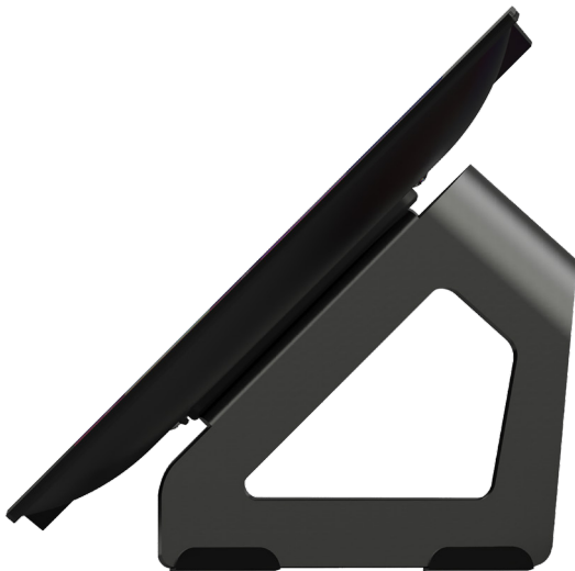
The Tabletop Stand is sold separately