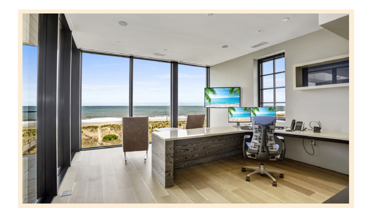
"RTI was a perfect fit for the project because its solutions are affordable, easy to program, and user friendly."

RTI Provides Intuitive Control Over Distributed Video Via Sleek Interfaces in Delaware Vacation Beach House